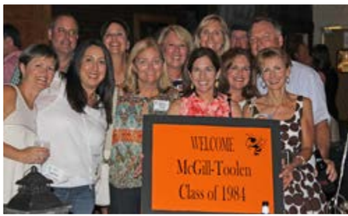
Class of 1984