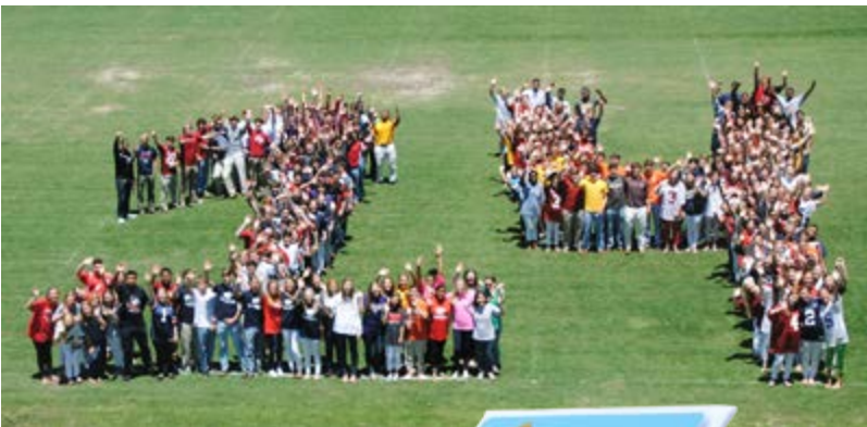
Class of 2014

16 Seniors received athletic scholarships in the following: Football Track & Field Volleyball Swimming Basketball Baseball