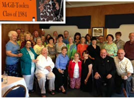
BT, COM and MI 70th Birthday Celebration