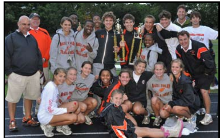
The boy's and girl's track team enjoy a big win as Sectional Champs